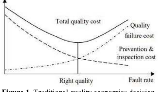
Figure 1. Traditional quality economics decisionmaking

in views. The higher quality needs to pay higher costs the supplier has to adopt a practical attitude and economical consideration got gaining better benefits. Where the whole quality cost is the minimum the right quality should be controlled at the most economical level.